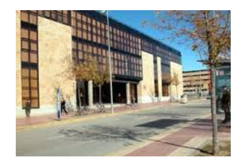
Facultad de Economía y Empresa – Main Entrance