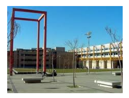
Univ. de Salamanca – Campus Miguel Unamuno