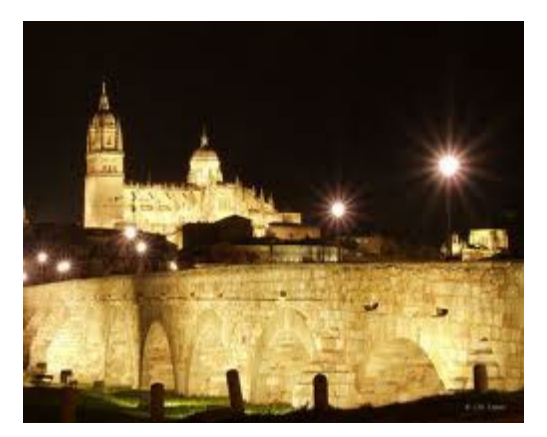
View of Salamanca – Cathedral and Roman Bridge

Salamanca is a city in western Spain, in the region of Castilla and León. Because of its beautiful buildings and urban environment, the Old City was declared a UNESCO World Heritage Site in 1988. It is the most important University City in Spain and is known for its contributions to the teaching of the Spanish language. Salamanca attracts thousands of international students, generating a diverse multicultural environment.