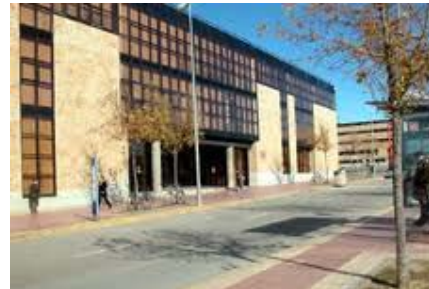
Facultad de Economía y Empresa – Main Entrance