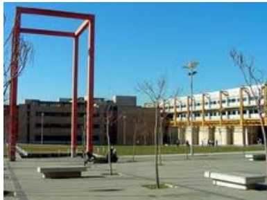
Universidad de Salamanca – New Campus

The Facultad de Economía y Empresa is located in the new campus of Universidad de Salamanca, just some minutes away from the bus station. The main entrance to the Course Venue is from 'Paseo de Francisco Tomás y Valiente'.