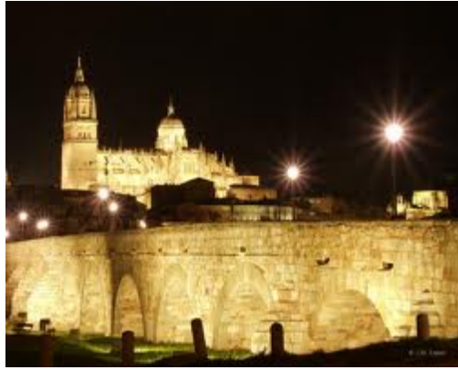
View of Salamanca – Cathedral and Roman Bridge

It is situated approximately 200 km (124 mi) west of Madrid and 80 km (50 mi) east of the Portuguese border. The University of Salamanca, which was founded in 1218, is the oldest university in Spain and the third oldest western university. With its 30,000 students, the university is, together with tourism, the economic engine of the city.