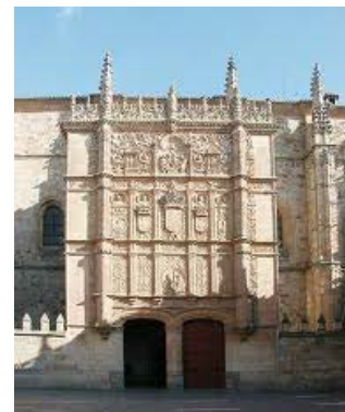
Old Facade – Universidad de Salamanca

Salamanca is a city in western Spain, in the region of Castilla and León. Because of its beautiful buildings and urban environment, the Old City was declared a UNESCO World Heritage Site in 1988. It is the most important University City in Spain and is known for its contributions to the teaching of the Spanish language. Salamanca attracts thousands of international students, generating a diverse multicultural environment.