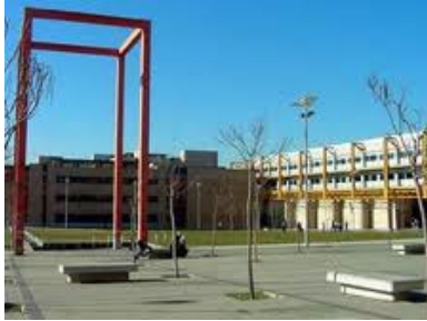
Univ. de Salamanca – Campus Miguel Unamuno