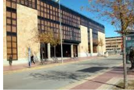
Facultad de Economía y Empresa – Main Entrance