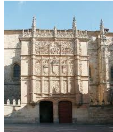
Old Facade – Universidad de Salamanca

Salamanca is a city in western Spain, in the region of Castilla and León. Because of its beautiful buildings and urban environment, the Old City was declared a UNESCO World Heritage Site in 1988. It is the most important University City in Spain and is known for its contributions to the teaching of the Spanish language. Salamanca attracts thousands of international students, generating a diverse multicultural environment.