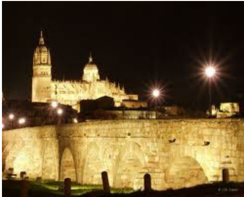
View of Salamanca – Cathedral and Roman Bridge

It is situated approximately 200 km (124 mi) west of Madrid and 80 km (50 mi) east of the Portuguese border. The University of Salamanca, which was founded in 1218, is the oldest university in Spain and the third oldest western university. With its 30,000 students, the university is, together with tourism, the economic engine of the city.