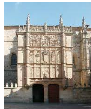
Old Facade – Universidad de Salamanca

Salamanca is a city in western Spain, in the region of Castilla and León. Because of its beautiful buildings and urban environment, the Old City was declared a UNESCO World Heritage Site in 1988. It is the most important University City in Spain and is known for its contributions to the teaching of the Spanish language. Salamanca attracts thousands of international students, generating a diverse multicultural environment.