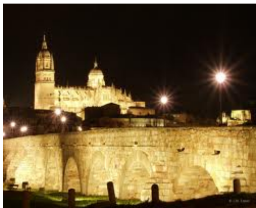
View of Salamanca – Cathedral and Roman Bridge

It is situated approximately 200 km (124 mi) west of Madrid and 80 km (50 mi) east of the Portuguese border. The University of Salamanca, which was founded in 1218, is the oldest university in Spain and the third oldest western university. With its 30,000 students, the university is, together with tourism, the economic engine of the city.