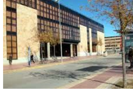
Facultad de Economía y Empresa – Main Entrance