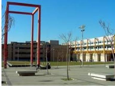
Universidad de Salamanca – New Campus